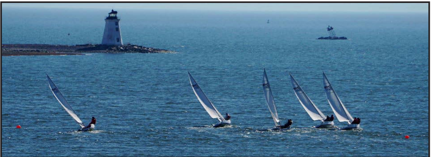
BRYC/FYC Ideal 18 Fleet racing off of Fayerweather Light House, Seaside Park, Bridgeport, CT.